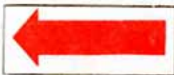
End of Restricted Zone (a)