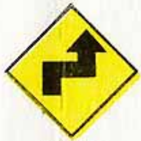
Right Turn Followed by a Left Turn