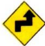
RIGHT TURN FOLLOWED BY LEFT TURN