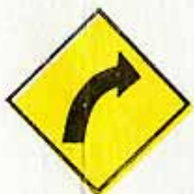
Sharp Right Curve