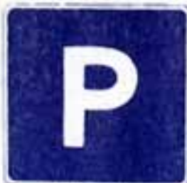
Parking Area or May Park