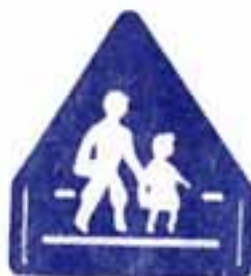
Cross Walk (b)