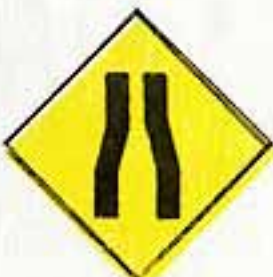
Width of Road Reduced