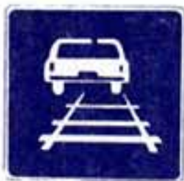
May Drive on Tram Way