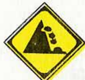
Possible falling stones