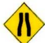
WIDTH OF ROAD REDUCED