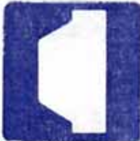
Pull Over Area