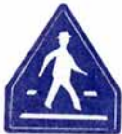
Cross Walk (a)