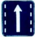
DIRECTION DESIGNATED LANE