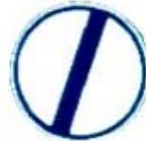
END OF RESTRICTED ZONE (b)