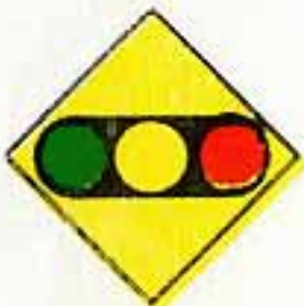
Traffic Signal Ahead