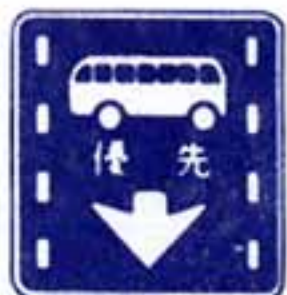
Bus priority lane