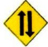
TWO WAY TRAFFIC