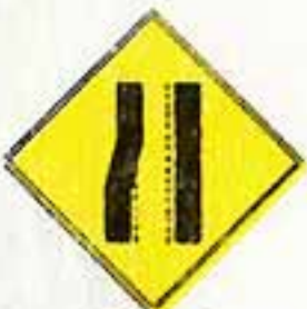
Number of Lanes Reduced