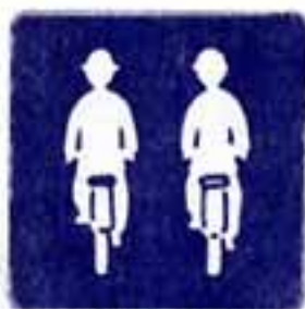
Double File Bicycle Riding Allowed