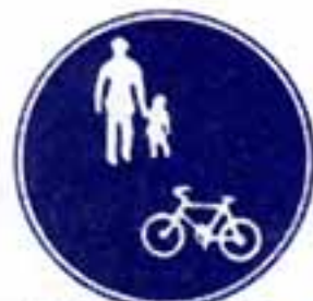
Exclusive road for bicyclist & pedestrian