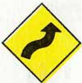
Gradual Right Curve