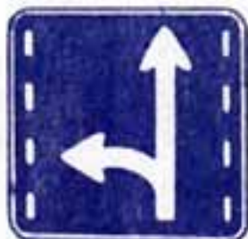
Direction designated lane