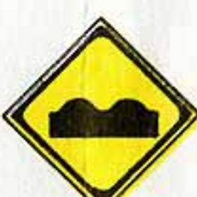
Bumpy road ahead