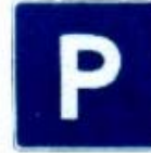
PARKING AREA OR MAY PARK