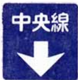
Designated Center Line