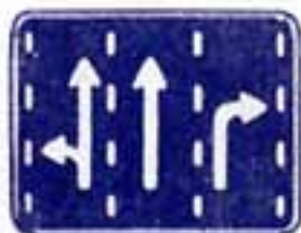
Direction designated lane