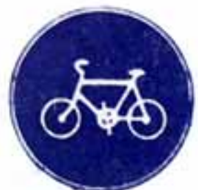
Exclusive road for bicyclist