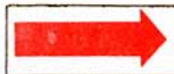
Beginning of Restricted Zone