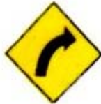
SHARP RIGHT CURVE