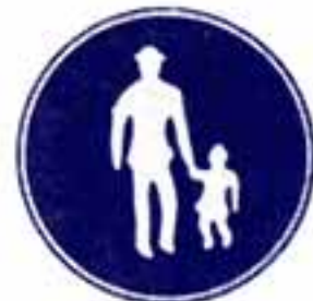
Exclusive road for pedestrian