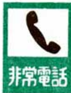
Emergency Telephone Available