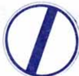
End of Restricted Zone (b)