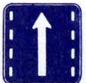
Direction designated lane