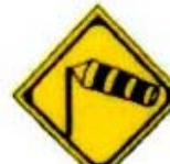
CAUTION, SIDE WIND