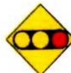
TRAFFIC SIGNAL AHEAD