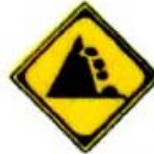
POSSIBLE FALLING STONES