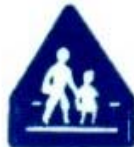
CROSS WALK (b)