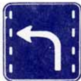
Direction designated lane