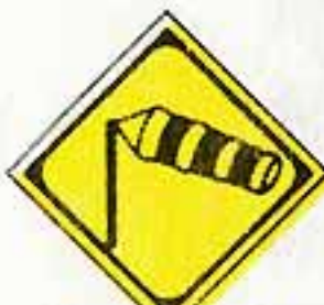
Caution, side wind