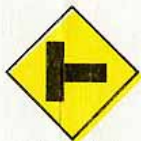
Side Road Ahead