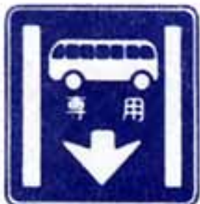
Bus exclusive lane