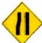
NUMBER OF LANES REDUCED